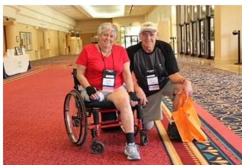
Your New Zealand Representatives