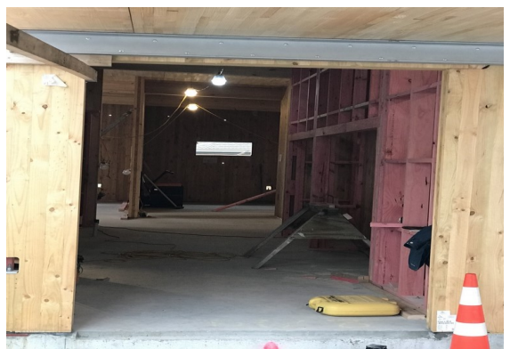
March 10 Framing up