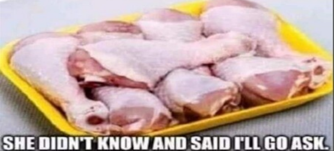
WHEN SHE GOT BACK SHE SAID, "NOT" FUNNY.