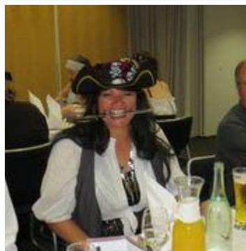
gal pirate Leigh